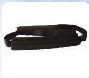
Standard Body Strap