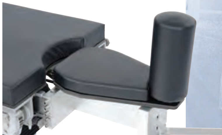
Perineal Post and Pad

Traction Bar Assembly includes: Leg spars, Lateral Leg Support with Clamp, Traction Boots, Perineal Post and Pad, adjustable Perineal Post and Pad, Curved Perineal Support, Leg Spur Support Poles, Knee Support Pad and Transport Cart.