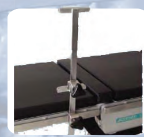
Lateral Cassette Holder