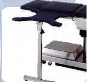
Hour Glass Hand Table