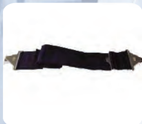
Wide Body Strap