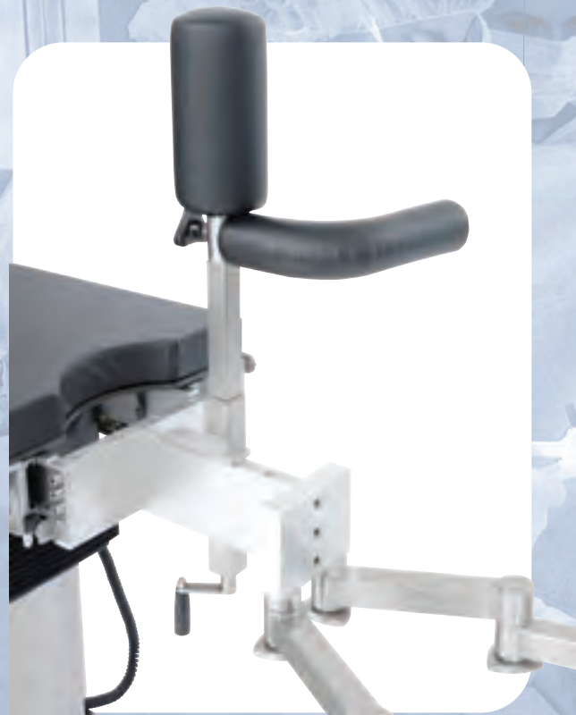
Adjustable Perineal Post and Curved Perineal Support