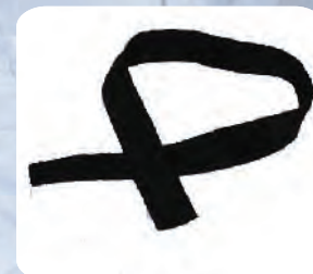
Small Width Strap