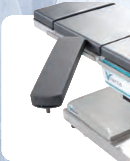
B2D00047 Standard Arm Board - Includes 2" Pad and Rail Clamp