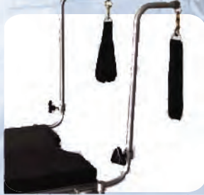
Lithotomy Leg Holder