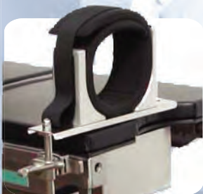
Arthroscopy Leg Holder