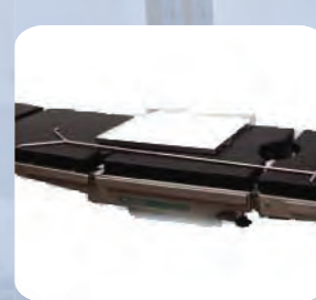
Cassette Tray with Handle