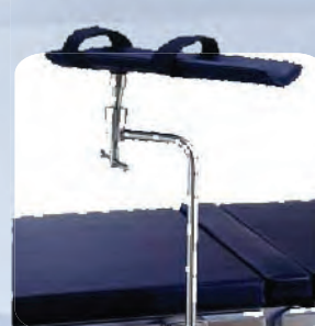
Arm Rest for Lateral Position